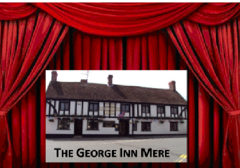
THE GEORGE INN MERE

For a pre-show supper, wine, or a beer, Or after a show, when the cast's had their cheer, Audience or player, from afar or quite near, You'll find a warm welcome, at the George Inn, Mere!